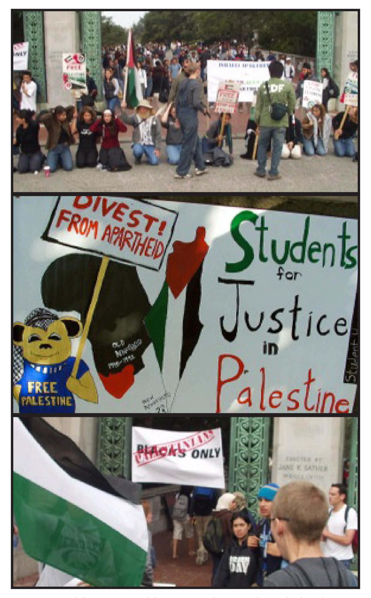
UC Berkeley: an anti-Israel demonstration during Israeli Apartheid Week