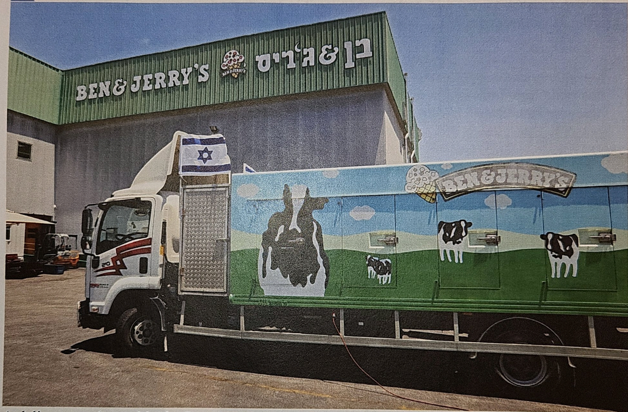
A delivery truck outside the Ben & Jerry's factory in Be'er Tuvia, Israel.

In the mid-1980s, during a trip to Vermont, I discovered a fledgling ice cream company called Ben & Jerry's. I was impressed by its quality, and set up a meeting with Ben Cohen. We bonded immediately, and I pitched him a plan to bring Ben & Jerry's to Israel. That's how I became the company's first licensee.