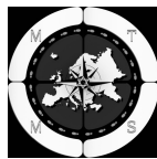
Make their Memory Shine