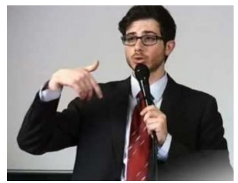
Arab-Israeli Diplomat for Israel,

March 23's announcement from the Regents of the University of California is particularly timely for the Davis campus, where a disruptive