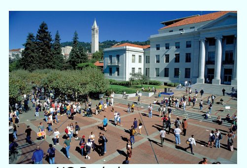
UC Berkeley campus

On the eve of Purim, March 23, the Regents of the University of California unanimously adopted a historic statement